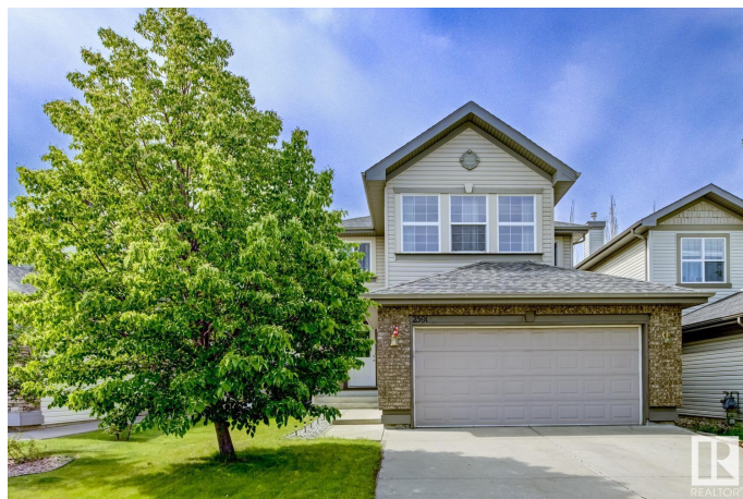
2591 Hanna Crescent NW